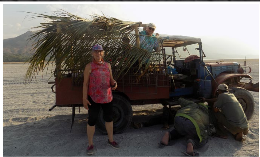
Weapon's Carrier broke down in the middle of Volcano Ash Desert.