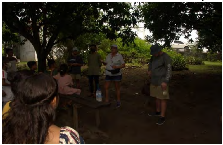
Breakout Session: Children's Ministry