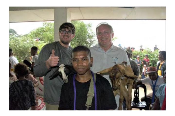
15 Pairs of Goats distributed to new Aeta Pastors